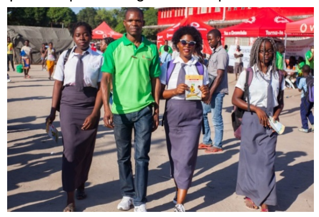
Students circulate through the Mobile One-Stop Event to see the wide range of services available.

response efforts due to their transient lifestyles. These include sex workers, truck and bus drivers, ship crew, formal and informal traders, and customs clearing agents. In addition, poverty drives adolescent girls and young women to engage in risky behaviours like transactional sex, often without the use of protection. This increases all groups' susceptibility to HIV infection.