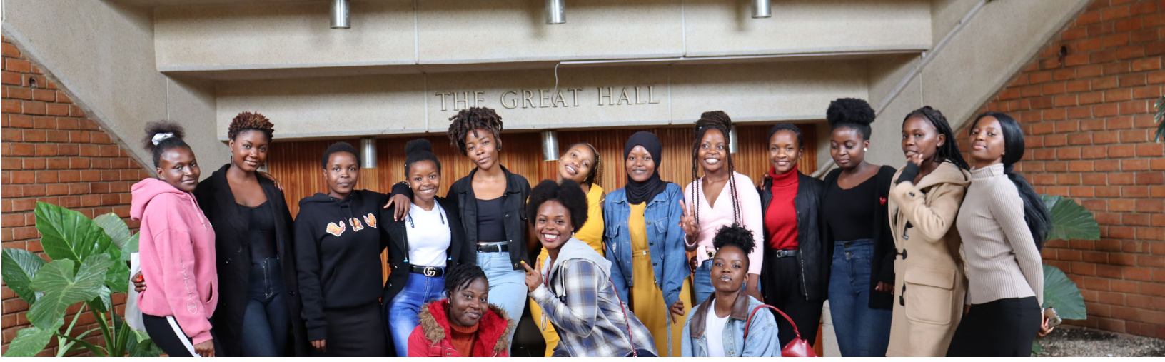
In support of the Government of Malawi's goal on HIV prevention and risk reduction and through the PEPFAR/USAID funded Ana Patsogolo project, The Bantwana Initiative of World Education has been implementing the DREAMS program since October 2020 in the districts of Blantyre, Machinga, and Zomba, reaching over 55,000 AGYW each year.